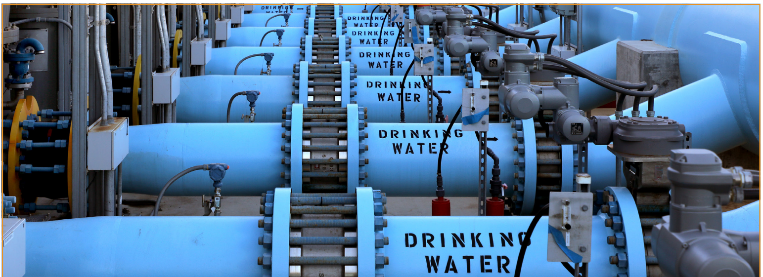
Drinking water pipes in the Claude "Bud" Lewis Carlsbad Desalination Plant.