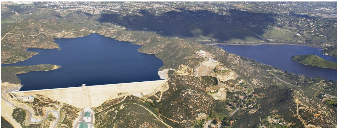
A pipeline between Olivenhain Reservoir (left) and Hodges Reservoir (right), can deliver water from Hodges into the Water Authority's aqueduct system.

For more information, go to sdcwa.org/lake-hodges-projects . ■