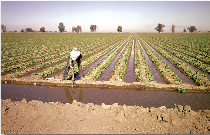
Over the life of the QSA programs, millions of acre-feet of water transfer from primarily agricultural use to primarily urban use.